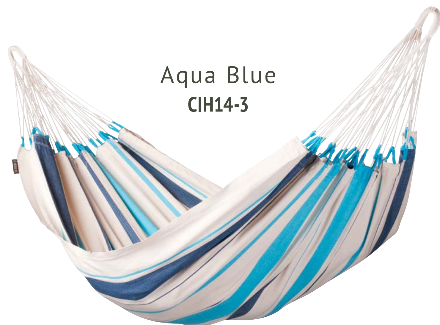
Aqua Blue CIH14-3