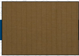
100% nylon ripstop material

The Thermolite® microfibre lining is supremely warm and cosy, soft as down feathers and highly compressible for taking little space when packed. Without a ground pad, it can be used at temperatures as low as zero degrees. In combination with a suitable ground pad, it can withstand temperatures well below freezing.