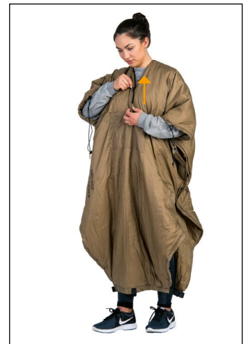
4. Close zip