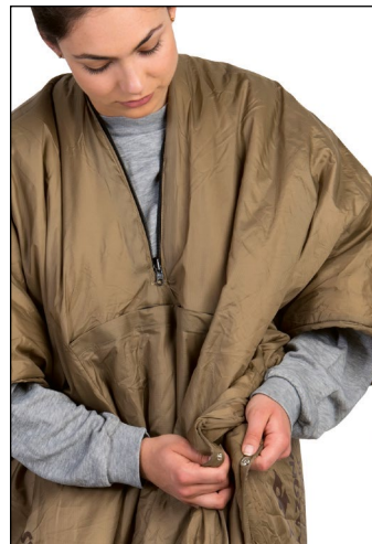
3. Fasten poppers