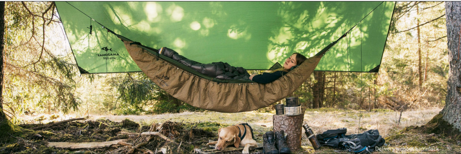
Delivery without hammock