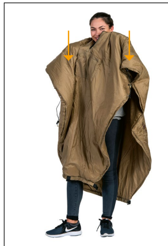
2. Pull over your head