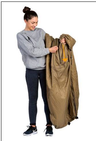
1. Open zip