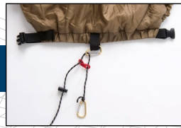
Suspension rope for underquilt function (detachable and continuously adjustable)