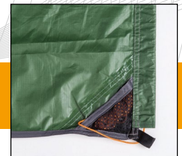
Small pockets for storing the ropes