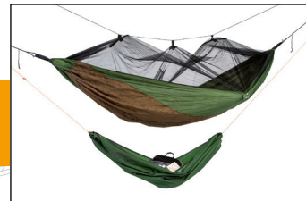
hammock / daypack not included