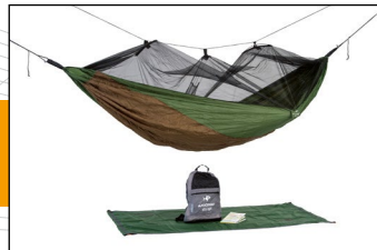
hammock / daypack not included