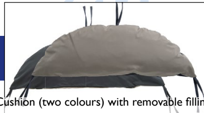
Cushion (two colours) with removable filling