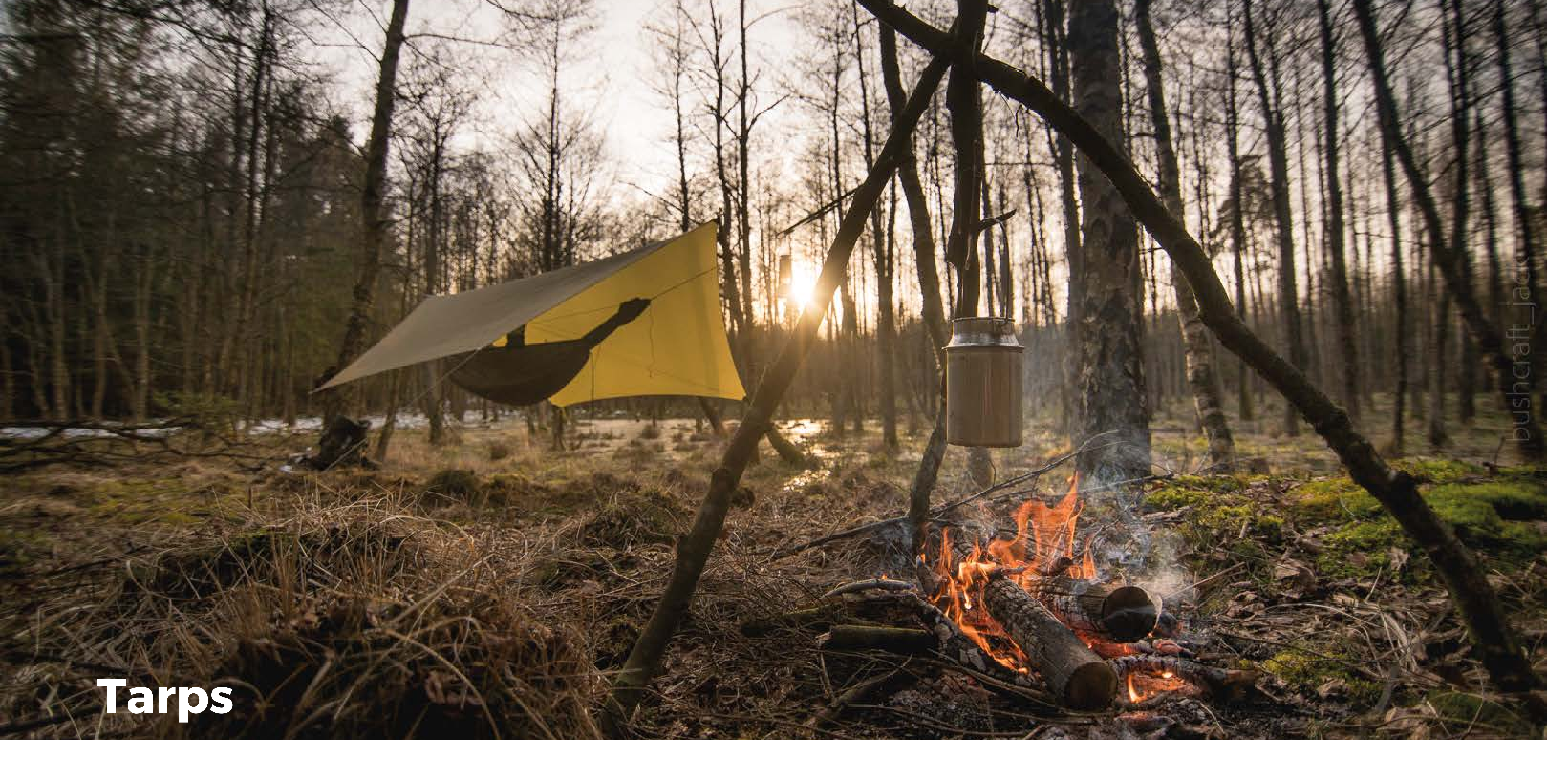
The key to perfect shelter? Low weight, lots of room and just a few minutes to set up. Tarps are minimalistic and intuitive shelter systems that will protect you from adverse conditions. They will give you a roof over your head whenever sleeping in a hammock, on the ground or simply as a central meeting point in the camp, for cooking or organizing your gear.